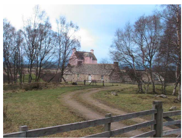
Fig. 6: 'Attinlea'