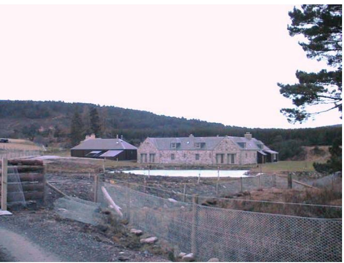
Fig. 3: Drum Steading

The background to the need for the currently proposed new access 3. road was investigated in the course of this current application, and a case has been advanced on behalf of the applicants stating that it is necessary to avoid the working farm steading at Muckerach as "it presents a potential health and safety hazard" and that "the Estate and its Tenant at Muckerach are anxious to minimise risk." pronounced risk is during winter when cattle are housed at Muckerach and when there are increased numbers of tractors and other vehicles operating around the farm steading. The case presented in favour of the proposed new access road refers to the fact that during that time of year the activities at the farmstead increase the likelihood of collisions or accidents that could be avoided by the creation of a new access. Reference is also made to the fact that the busy winter period and associated farming practices at Muckerach coincide with intended periods of peak occupancy at the converted property at Drum, "when the owners and their guests will regularly be in residence."