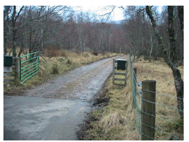
Fig. 7 : Access track leading to Ellon / Attinlea at junction with public road.