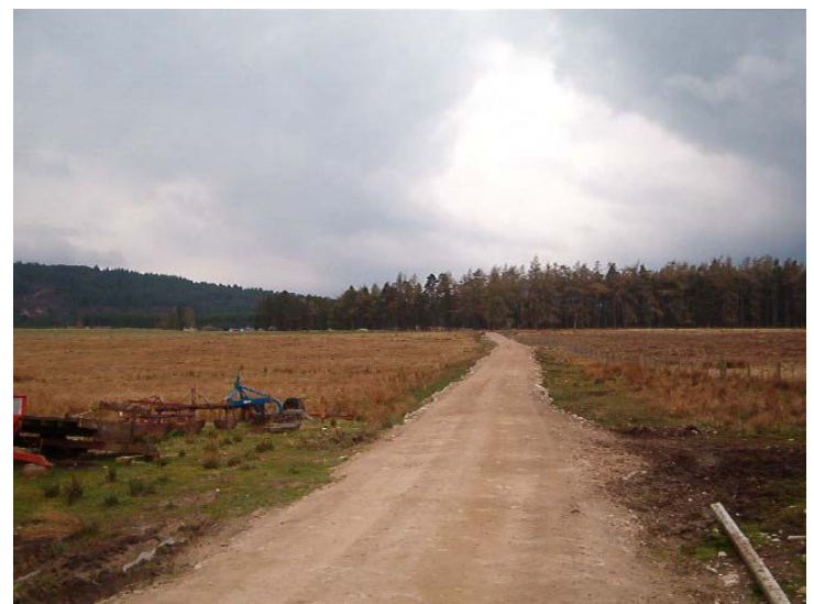
Fig. 8 : Existing access track leading from Muckerach farm steading to Drum Steading.

open land, and the actual track, together with the associated fencing would have a significant visual impact, and would undoubtedly appear alien to its landscape setting. An indication of the visual effects of a development of the nature proposed can be seen in examining the existing track, which follows the route of a long established track, but has recently been upgraded to facilitate access to Drum Steading (see Figs. 2 and 3). The proposed new section of track would further exacerbate the existing visual scars on the landscape.