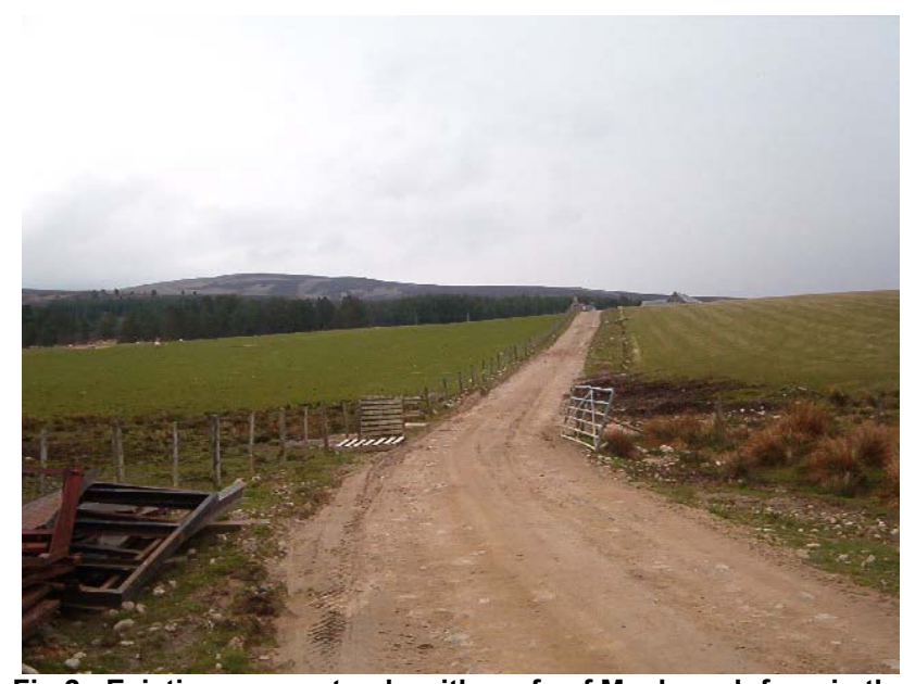
Fig.2: Existing access track, with roofs of Muckerach farm in the background.