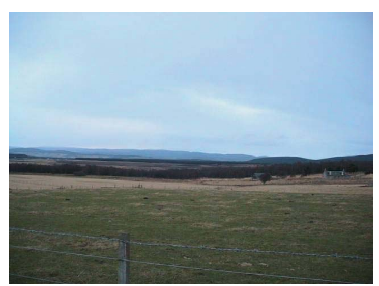
Fig. 9 : Proposed route of access track as viewed from existing track (property at Ellon located to right)

29. In considering the suitability of this type of development in the National Park, it is necessary to consider two important factors (1) the actual landscape setting - which as detailed above is a remote rural area of open and exposed countryside; and (2) the necessity for the proposed track. Paragraph 3 of this report details the case advanced in terms of need. In essence, the 'need' appears to be derived primarily from a desire rather than a necessity on the part of the owners of Drum