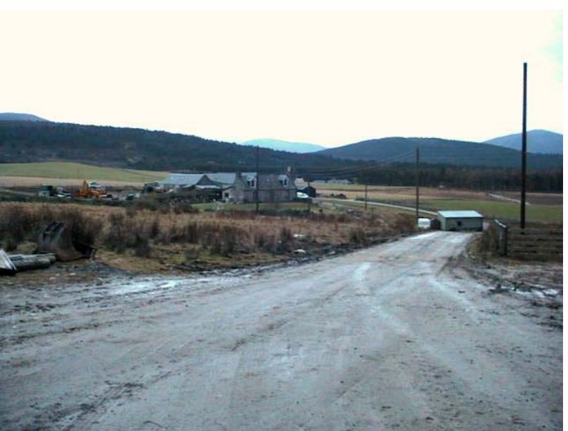
Fig. 10: View of the existing track from its junction with the public road, looking towards Muckerack Farmhouse and farm buildings.