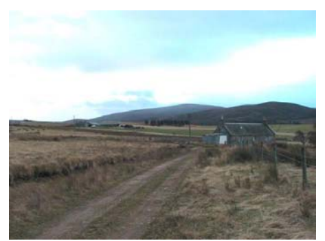
Fig. 4: Existing Ellon / Attinlea track approaching 'Ellon'